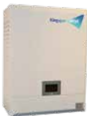
KSGFI-15k Grid Feed Inverter